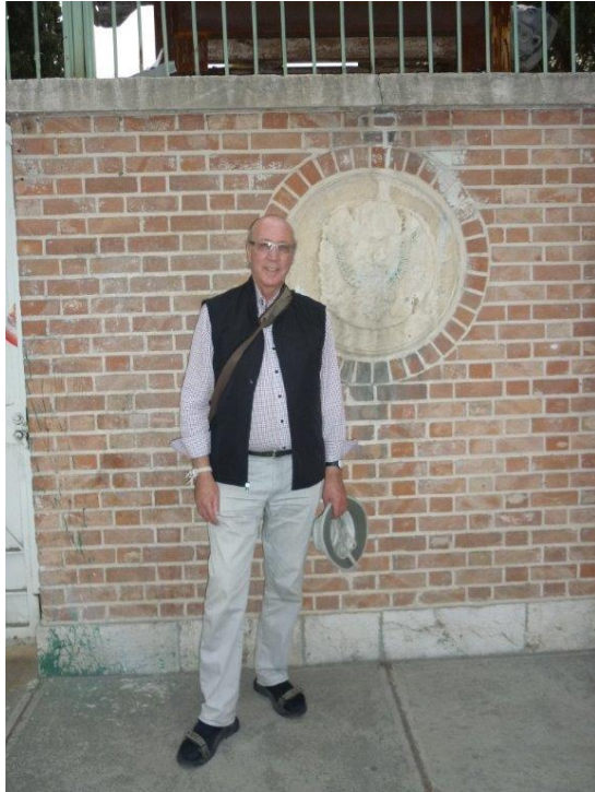
The infamous American Embassy in Tehran