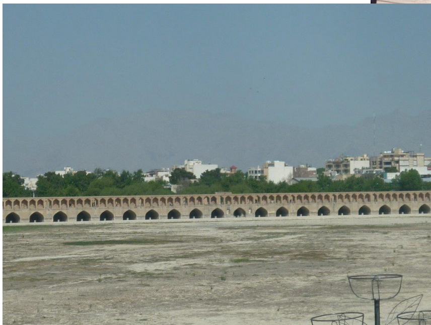
When a historic bridge meets an environmental controversy you get a dry river bed