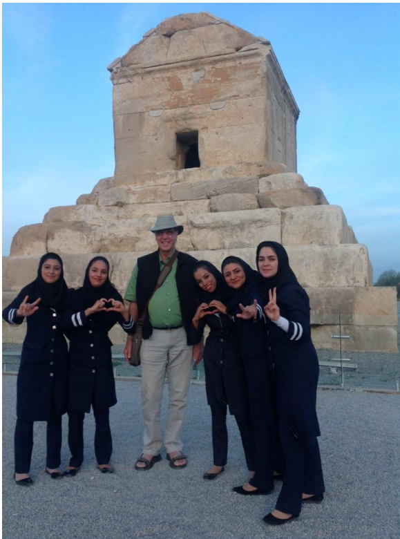
Deaf young women at tomb of Cyrus the Great. Note their hands - Message at the end was "I love You"