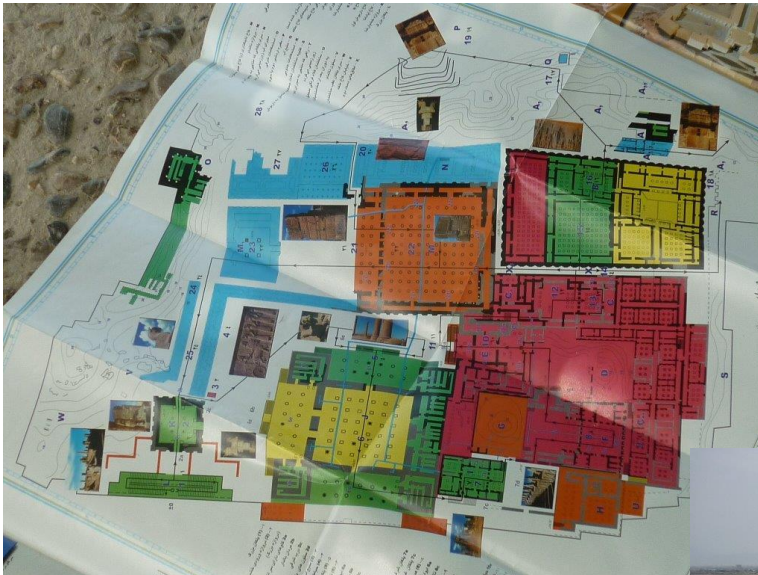
Original urban plans of Persepolis