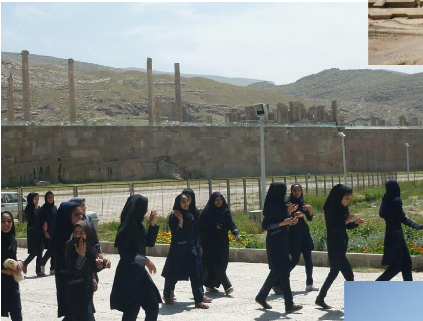
Students at Persepolis. Students are exposed to their history and literature