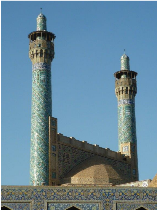
Historic and beautiful mosques in abundance