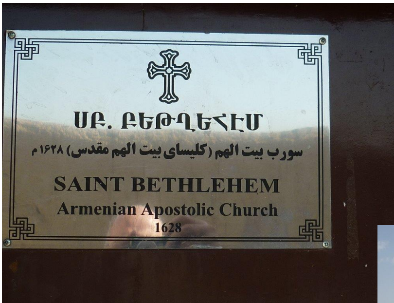
Armenian quarter in Isfahan